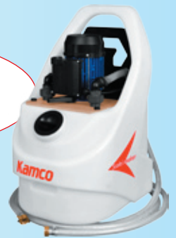
Scalebreaker C40 Standard model

Built to handle the strongest descaling chemicals