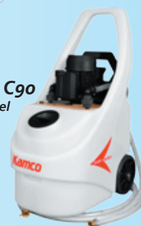
Scalebreaker C90 Standard model

Built to handle the strongest descaling chemicals